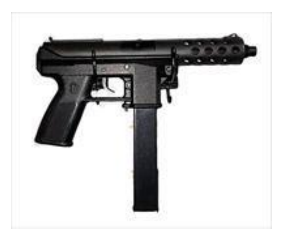
Figure 3 Intratec Tec 9 12

3. Intratec Tec-DC9 – 9mm pistol. The chamber of the weapon had a single round. The weapon was recovered from Ludd's vehicle at the Crime Lab. Also recovered from the vehicle were high capacity magazines and live rounds designed for this weapon.