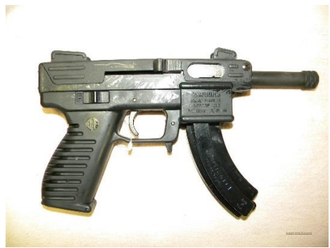
Figure 1 Intratec Tec-22 10

1. Intratec Tec-22 - .22 caliber pistol. The weapon had two rounds wedged into the chamber making the gun inoperable. Attached to the gun was a large capacity magazine containing 20 rounds. This weapon was recovered from the curb line near Ludd's body.