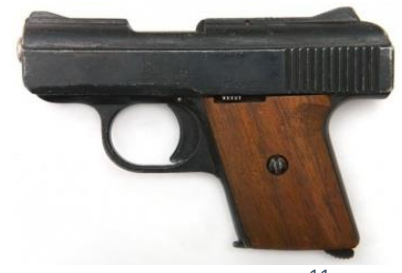
Figure 2 Raven Arms MP-25 11

2. Raven Arms MP-25 - .25 caliber pistol. The chamber of the weapon was empty. Inserted in the gun was a magazine with 6 rounds. The weapon was discovered in Ludd's pants pocket.