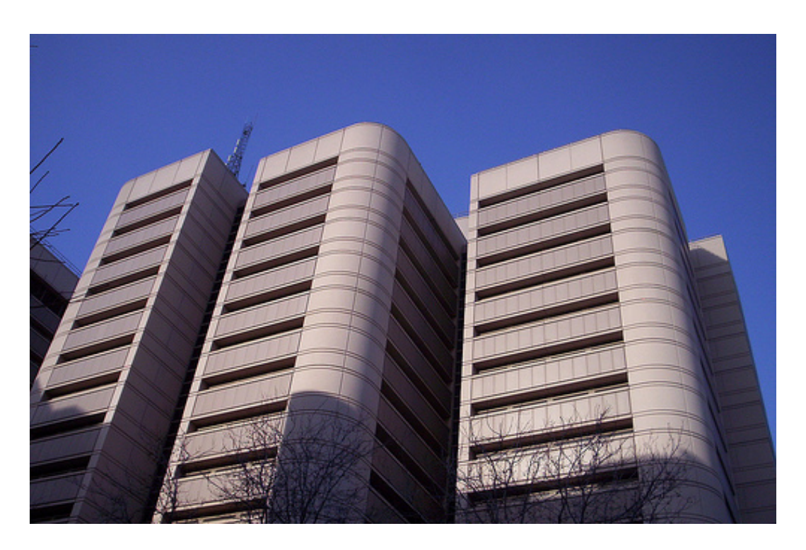
Sheriff's Main Jail, Sixth & I streets