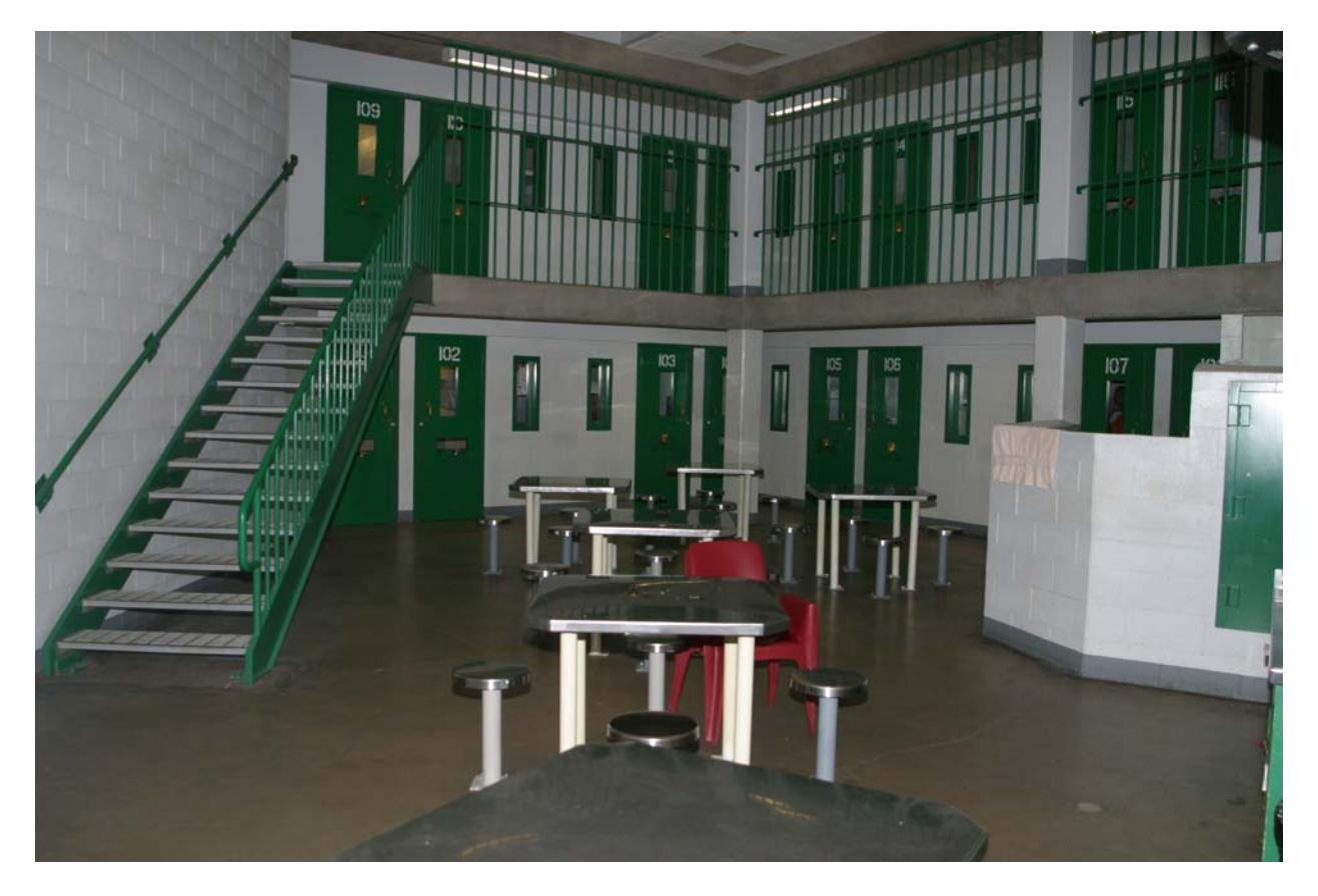
Rio Cosumnes Correctional Center

The Work Release Division employs a wide array of alternatives to traditional incarceration, thereby reducing both jail population pressures and the enormous cost of incarceration. The program was created in 1978 and has evolved into one of the largest alternative correctional programs in the nation. On average, 1,500 inmates participate in the program during any given week along with 300 inmates on home-detention electronic monitoring.